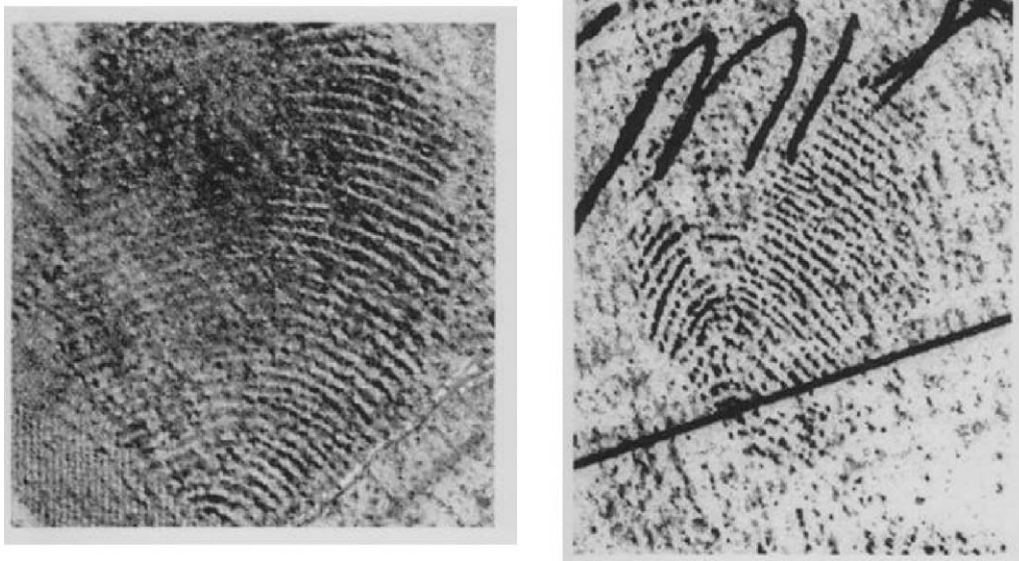
Fig. 1. Some latent marks were more affected by the presence of a target comparison print than other latent marks. For example, latent mark B (left panel) was more affected than latent mark D (right panel).

It is also interesting to note that the largest differences were observed with the latent marks that had the highest number of